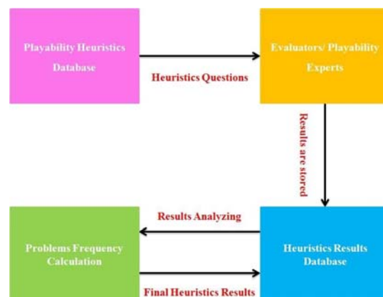
Figure 2: Evaluation method (heuristics)

The evaluators' role is giving severity to the game problems, relating each problem to playability attributes; determine the frequency and the impact of each problem, also they must mention in their reports to the usefulness or the difficulty of using the proposed heuristics. Besides, evaluators should decide the positive PX and negative PX based on the presented questions. We define a positive PX as any aspect that increases acceptability of playability attributes and properties of EVG; a negative PX is any aspect that decreases the acceptability of playability attributes and properties.