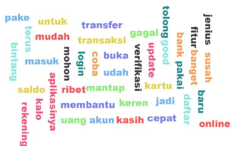
Figure 4: word cloud result from the keywords

Based on the research conducted, it was found that using the Naïve Bayes model, the accuracy rate obtained was 88.12%. This means that the sentiment analysis model using Naïve Bayes is proven to be good. In the sentiment analysis, the number of Twitter user tweets about digital banks in Indonesia that were considered positive amounted to 1330 tweets, but machine learning provided results that only 1108 tweets were considered truly positive with a recall percentage of 83.31%. Meanwhile, for the number of tweets considered negative, there were 656 tweets, but machine learning provided results that only 594 tweets were truly negative with a recall percentage of 90.55%. As for the number of neutral tweets, both before and after using machine learning, it remained the same at 404. Thus, neutral sentiment tweets have a recall percentage of 100%. From these results, it can also be concluded that the distribution of sentiment that is most prominent in customer satisfaction with digital banking services in Indonesia is positive sentiment. The distribution of positive sentiment is greater than neutral or negative sentiment.