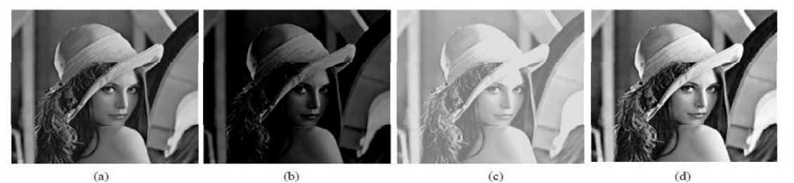
Figure 3: (a) Original 'Lenna' Image, (b) Low Contrast (Dark) 'Lenna' Image, (c) Low Contrast (Bright) 'Lenna' Image, (d) Histogram Equalized 'Lenna' Image [6]