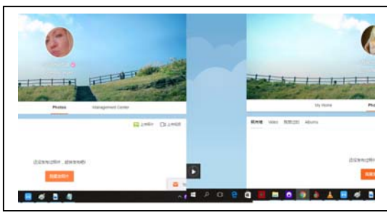
Figure 3: Example For Sina weibo fake profiles; Two profiles same name, different pictures, left side is legitimate and right side is fake

Sina Weibo (Hereafter Weibo), a Chinese version of Twitter released by Sina corpo-ration in August 2009, has become the most popular Online Social Network platform in China. Weibo provides API service for developers to access their data. In Weibo, there is an up-limit of out-links, we browsed the web and found several blogs and web sites where people have identified and listed the fake profiles.